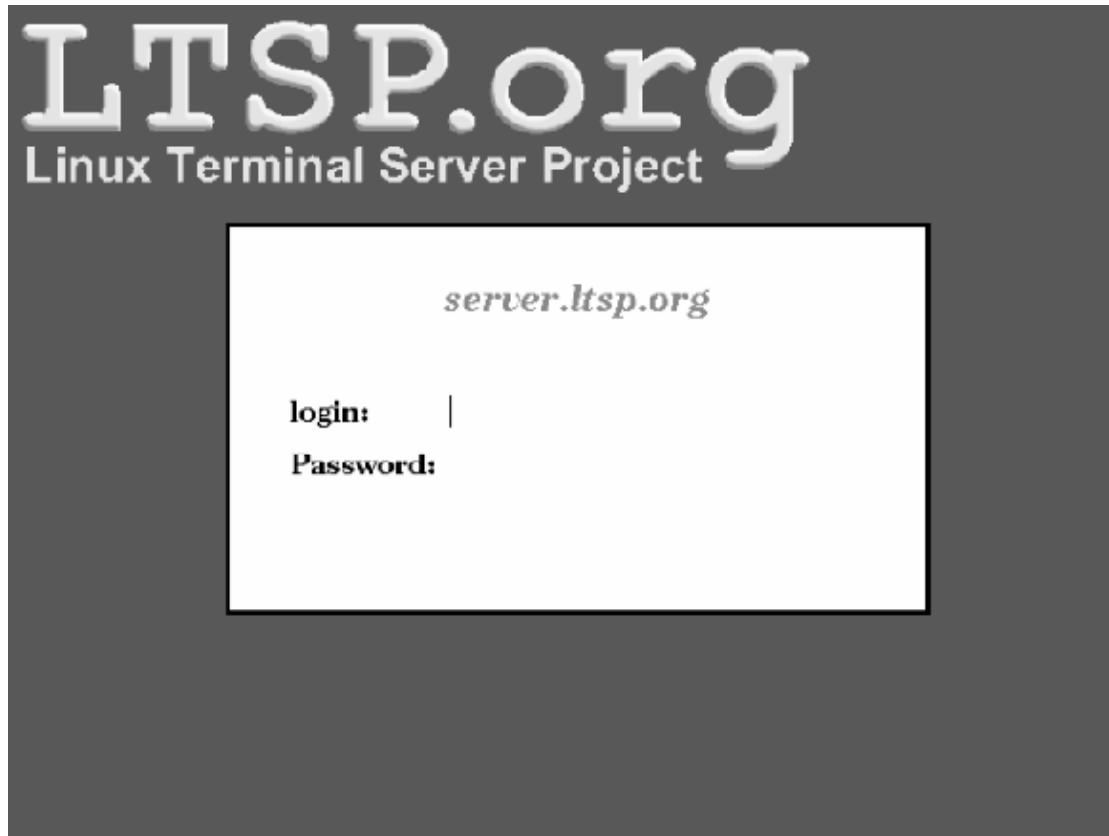
Figure 4–1. Login screen

The Etherboot code will be read from the floppy into memory, the network card will be found and initialized, the dhcp request will be sent on the network and a reply will be sent from the server and the kernel will be downloaded to the workstation. Once the kernel has initialized the workstation hardware, X windows will start and a login box should appear on the workstation, similar to the example below.